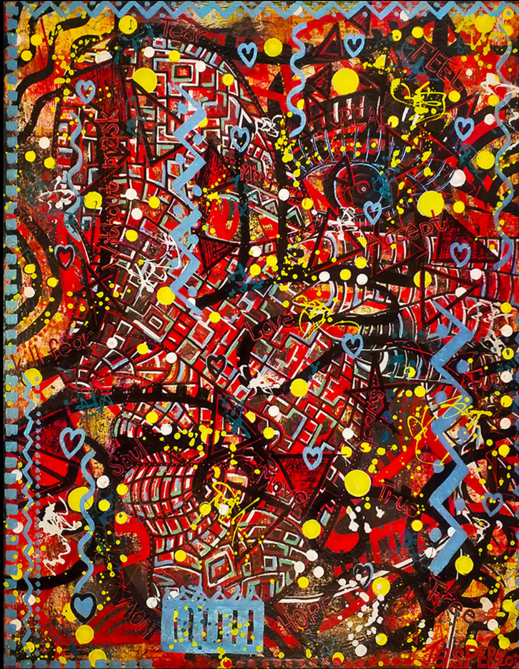
Hiding behind a living mask